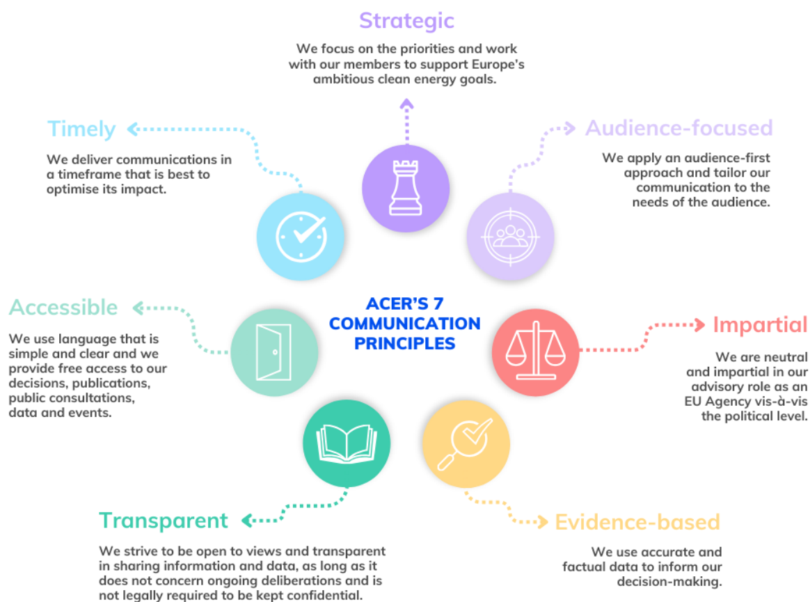
Figure 1: ACER's seven communication principles

Our shared commitment to these communication principles (shown in Figure 1) allows us to work together to achieve our communication goals.